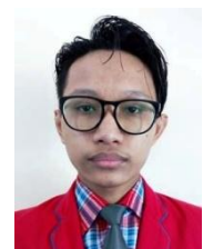
Mosemsanger Lemtur Science 80%