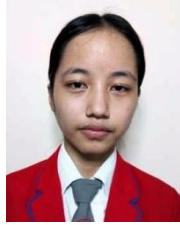
Dzewe U Tsidu Humanities 87.4%